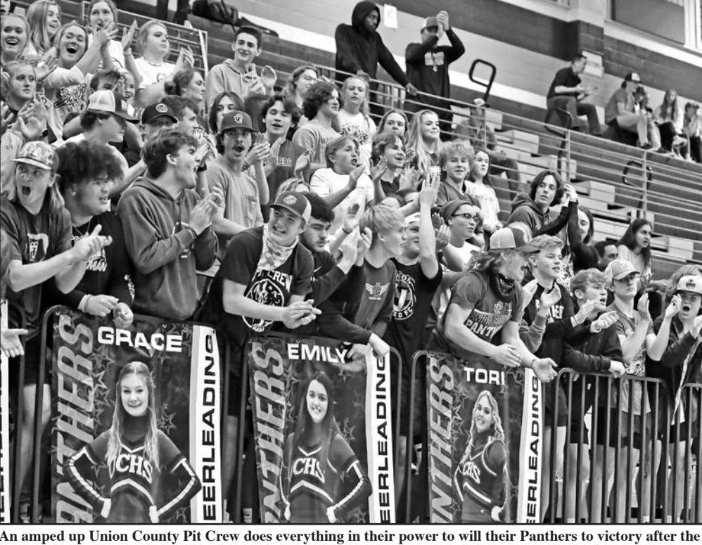
tide started to turn against the home team during the final minutes of last Wednesday's State playoff contest vs. Lovett.

Last but not least, Union County track and field will travel to Chestatee on Thursday, March 3.